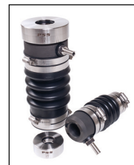
PSS Shaft Seal Packless Sealing System