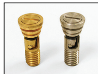
Floor Anchors Steel & Brass Floor Anchors