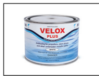
Velox Plus Antifouling Paint