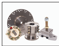
R&D Marine Drivetrain Solutions