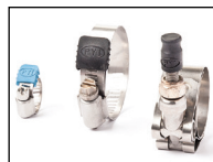
Clamp Jacket Hose Clamp Tail Covers