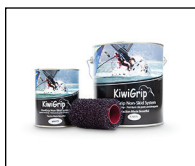
KiwiGrip Non-Skid Coating