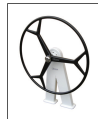
Jefa Rudder, Rudder Bearings, Autopilot & Steering Systems