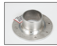
Machining Full Service Machine Shop