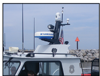
Seaview Marine Electronic Mounting Solutions