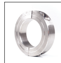
SRC Shaft Retention Collar