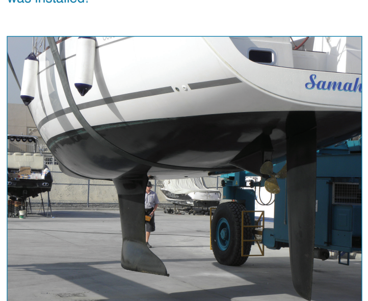
The bottom of the Beneteau Oceanis 37 is complete \underline{\text{fouling free after two}} years in the water

The system has been installed for well over 2 years now with excellent results. So much so that the speed log paddle wheel has not needed cleaning since the Sonihull system was installed!